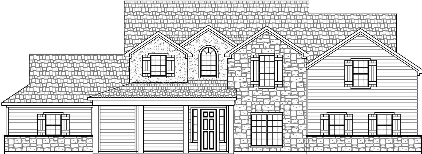
FRONT ELEVATION -A-