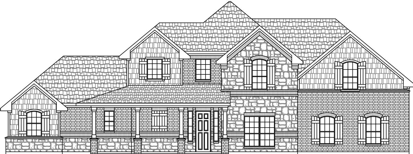
FRONT ELEVATION -B-